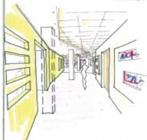
Learning Teaching Scotland