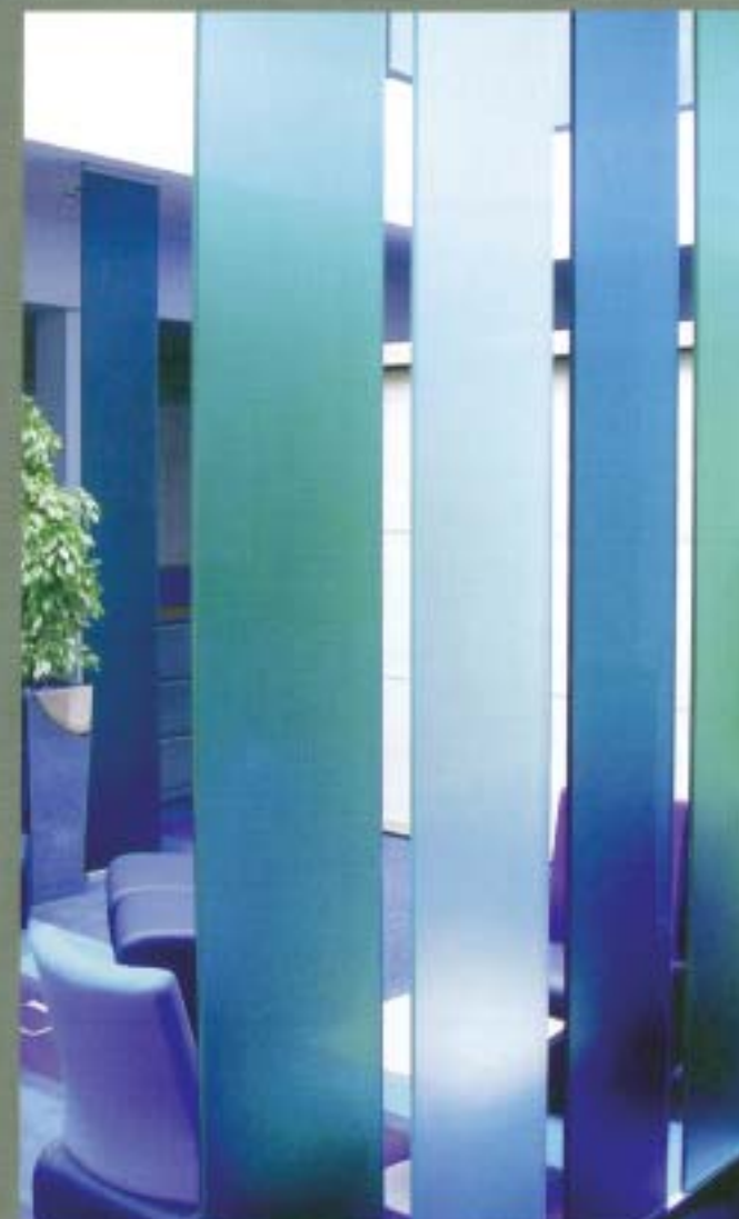
Financial Services Association (FSA)