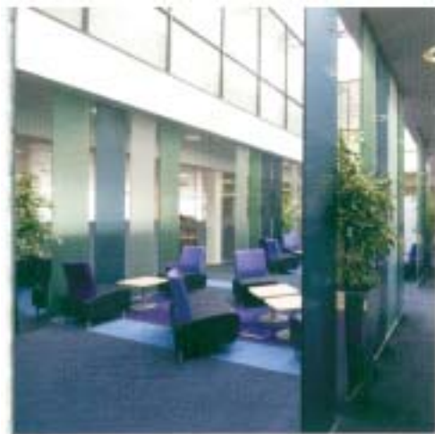
Financial Services Association (FSA)