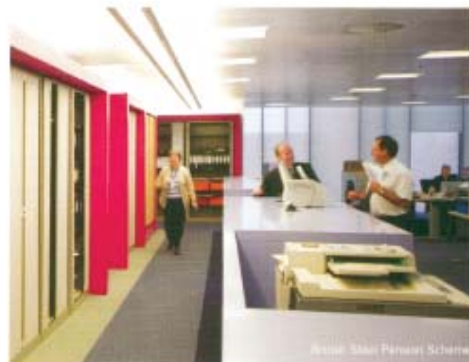
British Steel Pension Scheme

Working together with GHI Contracts, haa design provided the 'one stop shop' for BSPS in their move from Douglas House to The Sentinel. The service included design, construction, project management, cost management, furniture procurement and IT infrastructure. Needless to say, the project was completed within the specified budget and programme!