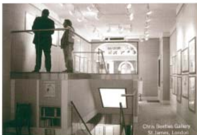
Chris Beetles Gallery St James, London

haa design have formed a joint venture company with Axis Mason to undertake interior design work in London, the South East and Jersey, where Axis Mason are already well established. This brings together a growing relationship between the two companies, and, besides assisting Axis Mason in their expansion in the South East, gives haa design access to serious architectural strength for their move into architectural projects back in Scotland. The project below has just been completed by AM Interiors in London.