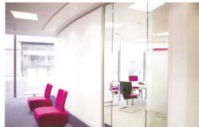
British Steel Pension Scheme