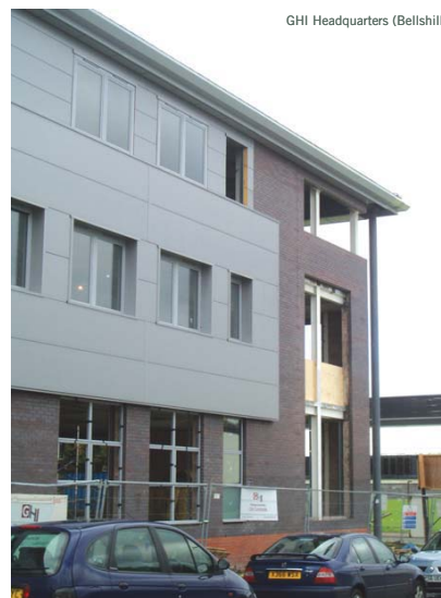
GHI Headquarters (Bellshill)

GHI's new headquarter building in Bellshill is now nearing completion and looking good. At 1,800 m2 new build it is organised over 3 floors and will have taken 12 months from initial briefing to practical completion. The architecture team now hands over to the interior designers to complete the fit-out.