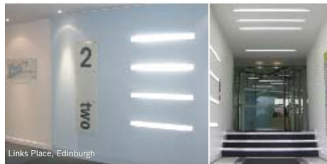
Links Place, Edinburgh

haa design have been working with J Smart & Co (Contractors) plc on the refurbishment of the public areas of Great Michael House and Links House at Links Place in Leith. This fit-out is now complete with a refurbished atrium, reception areas, lift lobbies and toilets to the two buildings.