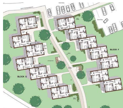
St Andrews University

haa design have been assisting the University in their development of the brief for various major new projects, including their new medical school, the re-development of their new library and the re-development of their Fife Park residential flats. This has involved both consultancy work and feasibility studies to see what is possible and desirable.