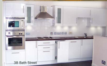
38 Bath Street