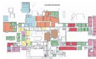
Banff & Buchan College

The gradual development of an 'Outline Business Case' for submission to the Scottish Funding Council has moved forward, with various exercises working with the College to determine the size and nature of their teaching requirement in the future. haa design have been assisted in this by their 'research' projects for the SFC (looking at the impact of technology on learning and teaching spaces) and the JISC (looking at the design and management of technology-rich open plan spaces)