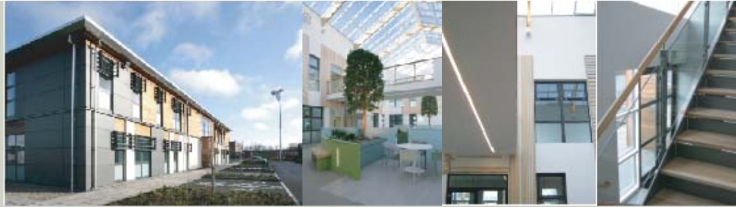
TORUS Building East Kilbride

haa design's business plan focuses on the development of its 3 key business areas - architecture, interior design and consultancy and recent months have seen useful progress in each of these areas. Architecture is booming with the handover of two major new builds in the past six months and the completion of a third at the end of October. Interiors secured a major term contract with South Lanarkshire Council in January and have moved into the area of health care in addition to their traditional (and growing) speciality areas of offices and education. Consultancy has focussed on education, with projects for various colleges and universities and the completion of a research project for the Joint Information Systems Committee (JISC) looking at the design of Social Learning Spaces.