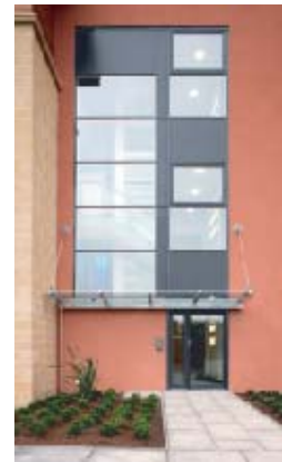
Dumbarton Road Entrance Foyer

Following hard on the heels of TORUS and undertaken also for Speyroc, the first phase of haa design's Dumbarton Road projects is now complete. Designed for a marginal office letting area, the development provides highly flexible, quality office space at an affordable rent. The project is one of the first office projects within the Clydebank Rebuilt regeneration project.