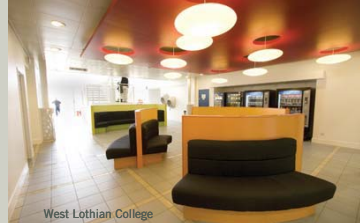
West Lothian College