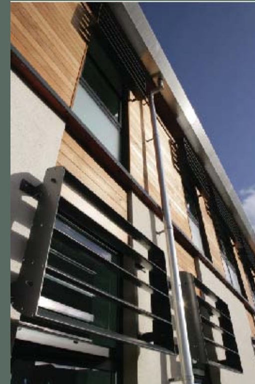
TORUS Building East Kilbride