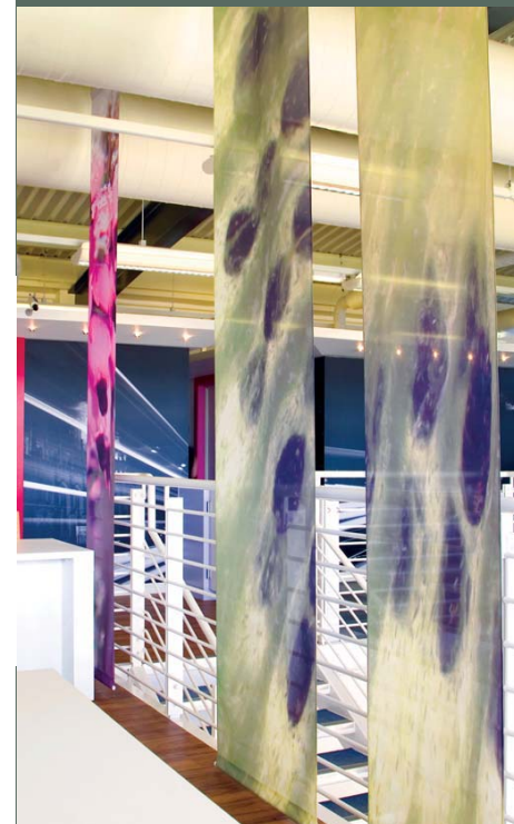
West Lothian College