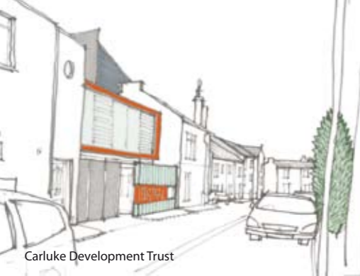
Carluke Development Trust