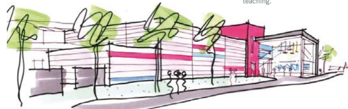
Banff & Buchan College

The B&B saga took a major step forward in the summer with a promise to the College of serious funding following its submission of an Outline Business Case. At the time haa design were engaged in a 're-engineering' exercise to see how their proposals might fit with a phased improvement programme. They are now proceeding with speed to turn these ideas into a detailed scheme design suitable for a 'Full Business Case'. haa design's proposals for skillful remodelling, as opposed to new build, have shown themselves to be both flexible as well as sustainable and cost effective. The proposals are also designed to provide a radically new working environment in line with changing trends in learning and teaching.