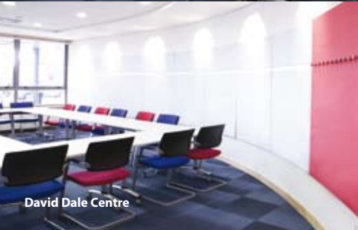
David Dale Centre