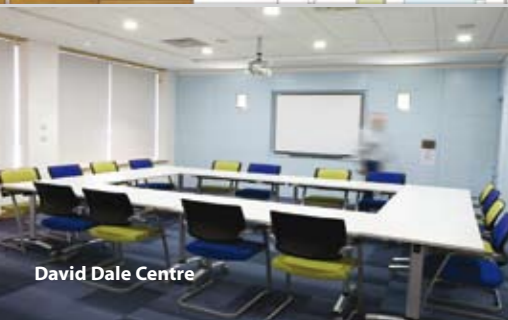
David Dale Centre