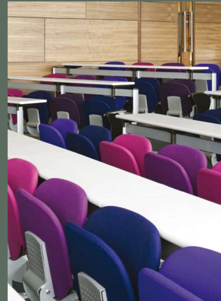
University of Glasgow - Adam Smith Lecture Theatre