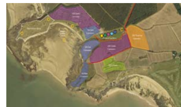
Shell Bay & Kincaig Hill

Working with a consortium haa design have been busy looking at development options in Fife, ranging from upmarket holiday houses to landscaped caravan sites and stand alone lodges with a variety of mixed use options in between. The intention is to provide something that will set new standards for holiday accommodation in Scotland.