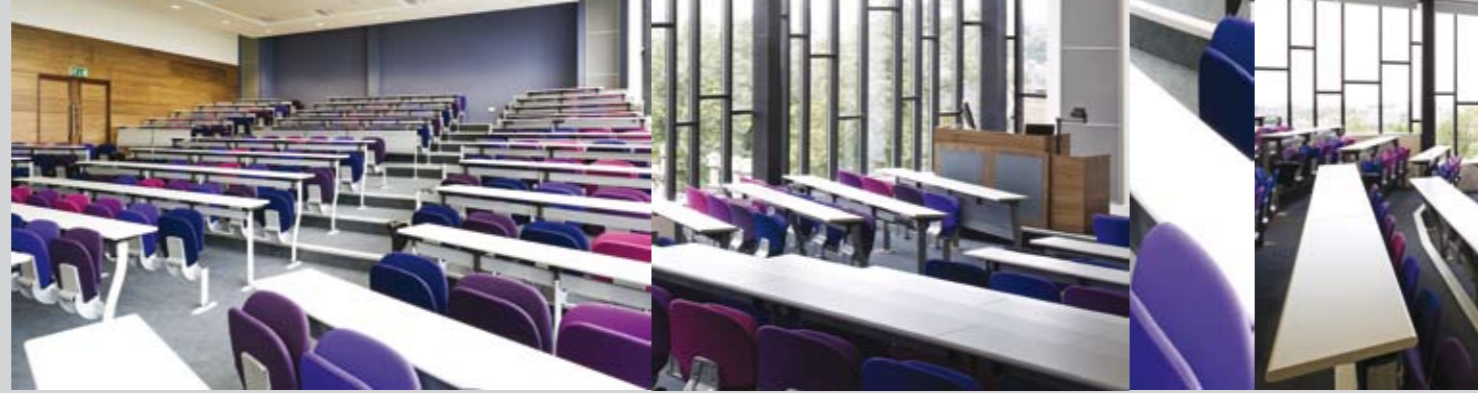
University of Glasgow - Adam Smith Lecture Theatre

It is tempting fate, but dare we say that haa design are reasonably placed to survive these troubled times. Our move into a greater amount of educational work is proving usefully counter cyclical and our commercial work is at present underwritten by some key pre-lets. We are even in expansion mode with a major collaboration proposal and the taking on of additional staff.