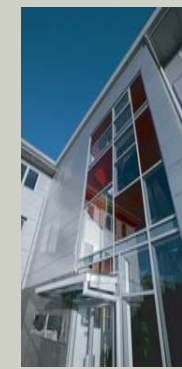
GHI - BELGRAVE COURT

The completion of Belgrave Court for GHI was a satisfying project for haa design , not just because it was pleasing to help a client with whom haa design has developed a long standing relationship, but because the project represented the coming together of various skills as part of haa design's longer term strategy: research, or at least an understanding of design issues at a theoretical level, leading on to design of buildings and the fitting out of interiors which are informed by this research. It is pleasing therefore that several of our projects, ranging from Belgrave Court, to the Venture Building, to Banff & Buchan College and the new building for Arup are all starting to follow this integrated pattern, hopefully to the benefit of our clients.