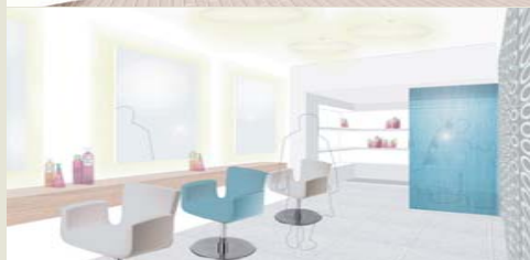
David Walker Care Centre