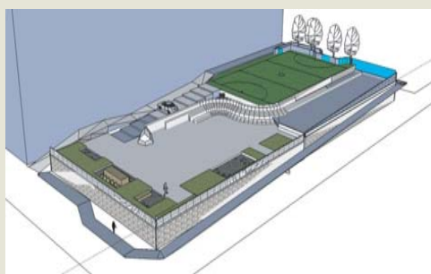
St Aloysius College