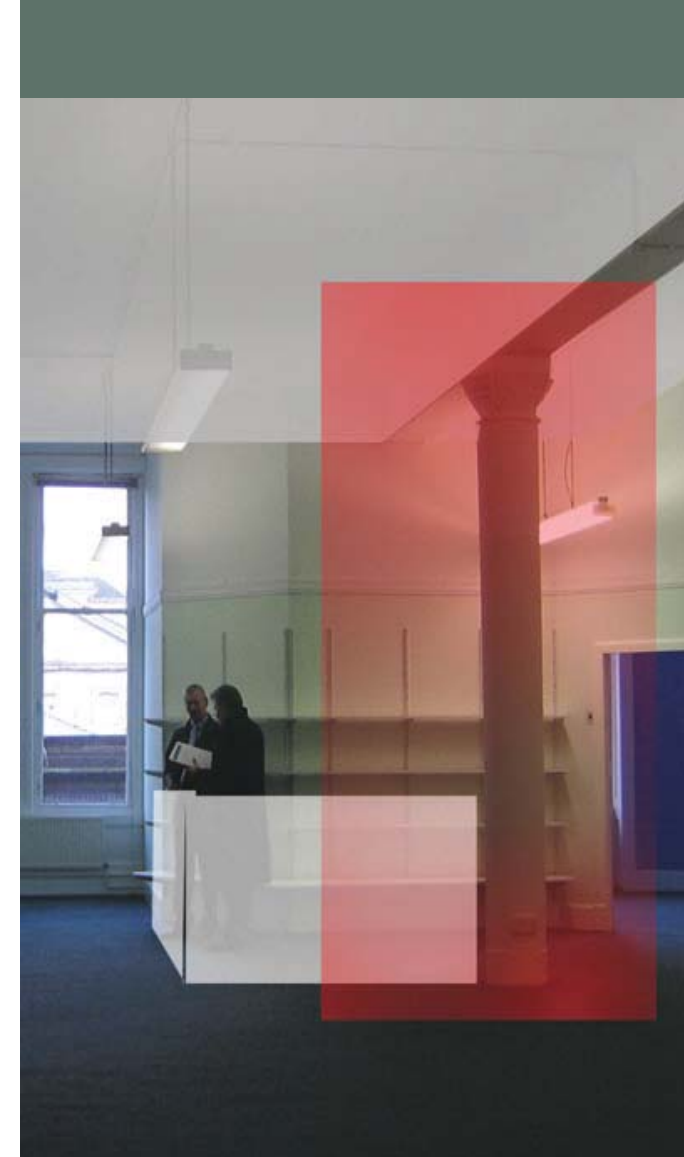
haa design - we're on the move!