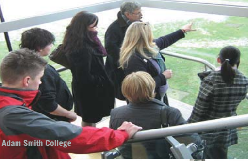
Adam Smith College

haa design have been retained to work with the College to find ways in which their existing buildings can be modified to respond to new ideas in learning and teaching. Our brief is also to work with a cross section of learners, teachers and support staff to develop with them an understanding of the issues involved. We have organised a series of workshops ranging from a "Speakeasy" to a Design Session to flush out opportunities and concerns and .....sympathy for the designer who has ultimately to pull it all together.