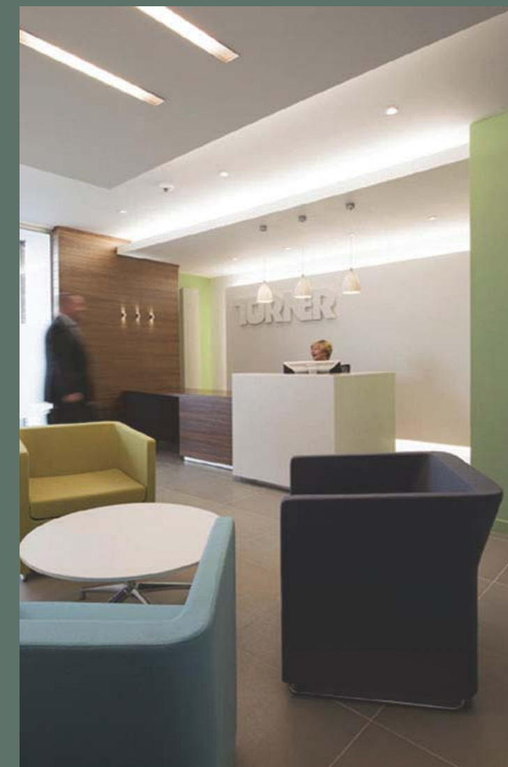
Turner Group, Glasgow