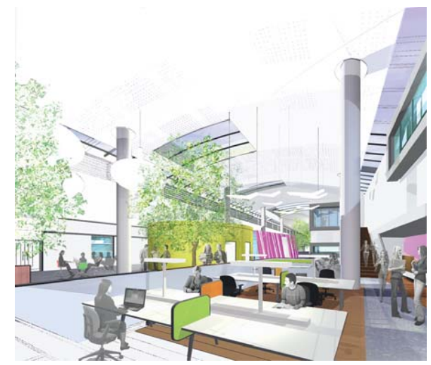
Banff & Buchan College

This major project progresses. A submission of the College's Full Business Case was made to the Scottish Funding Council in March and its Gateway 2 approval is anticipated in May. The design has been taken to RIBA stage D with the submission of a detailed Planning Application.