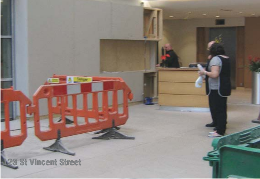
123 St Vincent Street

haa design are working with King Sturge on behalf of AVIVA to modernise the atrium of Glasgow's 123 St Vincent Street, at the same time as dealing with issues of security and access for maintenance. The hope is also to improve the usability of this space by softening it at low level, giving it more of a human scale and making it suitable for casual meetings. Still a building site and, until recently, a forest of scaffold poles, we hope that we have not tested the patience of users to breaking point.